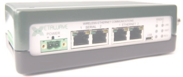
Dimensions (L x W x H): 6.625 " x 3.45 " x 1.835 " / 16.83 cm x 8.76 cm x 4.66 cm Weight 1.54 lbs / 700 grams